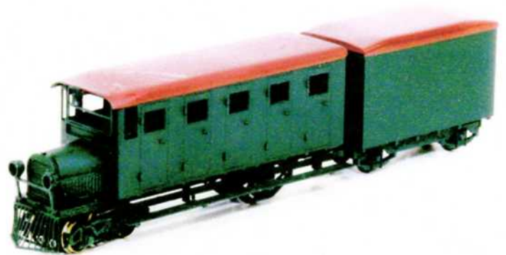
Sandy River & Rangeley Lakes Railbus # 4 (Sn2) Imported by Train & Trooper.