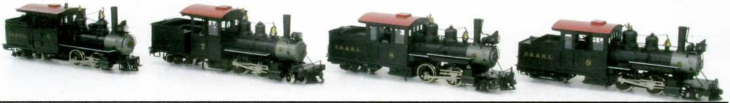
Four of the featured locomotives, Sandy River & Rangeley Lakes # 6 Small Forney (Sn2), Wiscasset, Waterville & Farmington # 7 (Sn2), SR&RL # 8 large Forney (Sn2), and SR&RL #9 large Forney (Sn2) all imported by Train & Trooper