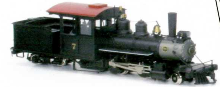
# 7 A Wiscasset, Waterville & Farmington Sn2 Forney locomotive.