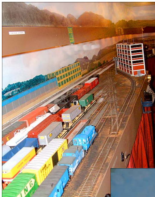
A view of Bert's Conrail Eastern, two decks, looking north. This model railroad is still under construction.